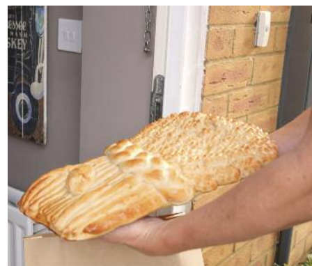
Harvest loaf arriving on Sheppey