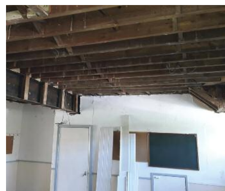
The main room - current state

I am the Bread of Life. Whoever comes to me will never go hungry, and whoever believes in me will never be thirsty.