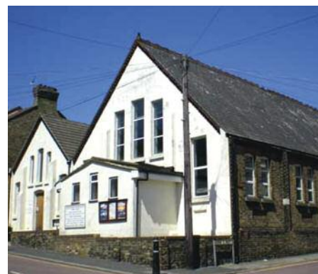
Strood Gospel Mission Church