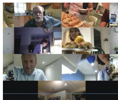
Online Bread of Life Course