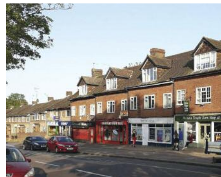
The parade of shops in Darnley Road, Strood