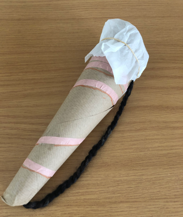
'Hum' into the trumpet!

Secure greaseproof paper tightly with rubber bands.