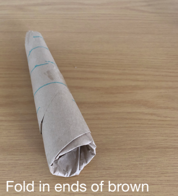
Fold in ends of brown paper to secure. Decorate with pens.