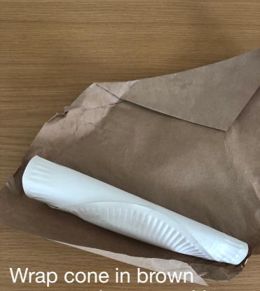
wrap cone in brown paper and secure with tape.