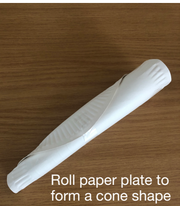
form a cone shape and secure with sellotape.